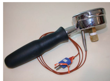
Figure 2. Portafilter thermometer side view showing the thermocouple probe's exit through the bottom of the portafilter, and the brew water metering orifice.