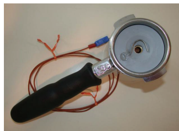
Figure 1. Portafilter thermometer top view, showing the type-T thermocouple probe and the coffee cake facsimile.

A fast-responding, electronic temperature probe, positioned as described above, senses the temperature of the water. The probe is mounted in a modified portafilter and filter basket, so that the probe may be conveniently inserted in different machines. For ease of use, measurement consistency, and to ensure that the probe contacts only water, the coffee cake is replaced by a proxy cake. The flow rate of pressurized water through the portafilter is established by a valve, or another metering device. The temperature data is read using a suitable readout device, or a data logger. The requirements of these items will now be discussed in detail. An example of the intended measurement system is depicted in Figures 1-3.